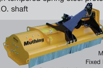
Multi position Fixed Head-Stock Cat. I + II for front or rear mounting