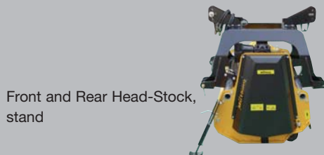
Front and Rear Head-Stock, stand