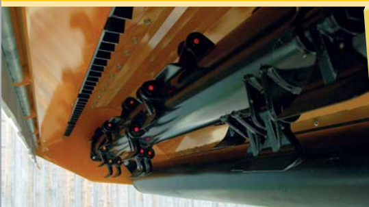
High tempered spring steel protection flaps, Spiral rotor, Internal bearings to protect against dirt, wear and tear