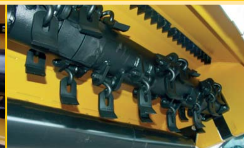
Spiral rotor with specially made "M"-Shackle flails as option