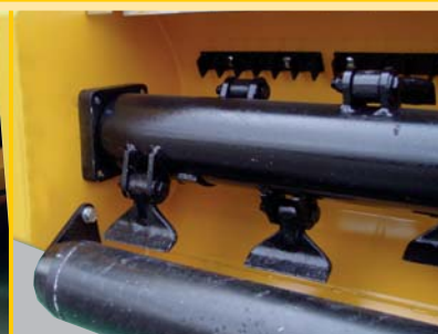
Shredding bar built in segments, High tempered "M"-Hammer-flails with specially formed lugs, Self-cleaning roller